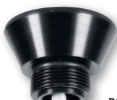
Friction Lock style