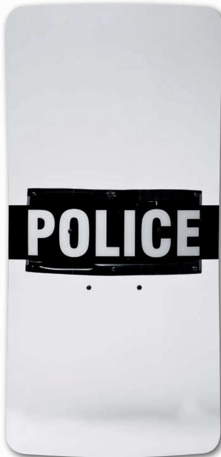
FRONT Optional Police Decal Shown