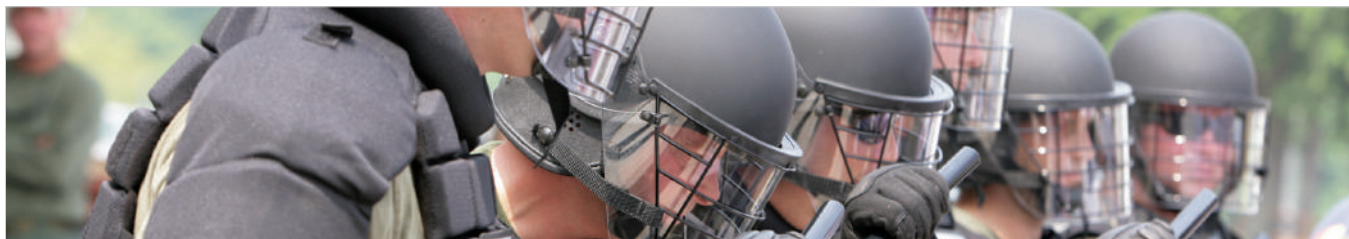
CPX2500 SOFT-SHELL TORSO PROTECTOR

This protective piece is a must for riot control and cell extractions, effectively protecting the torso and shoulders from blunt force trauma. The lightweight, cellular pad design provides ample protection and allows excellent mobility. Includes attachment points for our HUEX100 Hydration System.