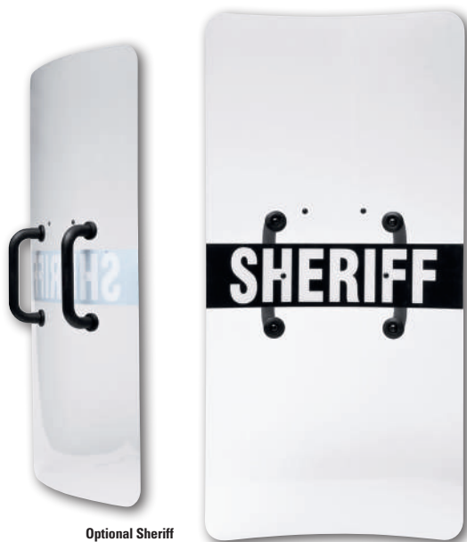
Optional Sheriff Decal Shown