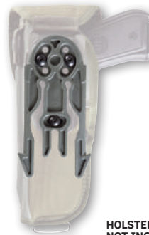
HOLSTER NOT INCLUDED